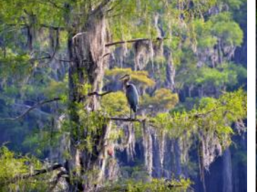
16 x 20 mounted frameless print 'Blue Heron"