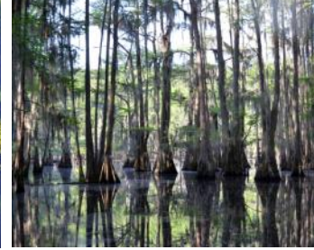
16 x 20 mounted frameless print "Clear Lake Morning"