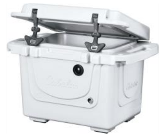
25 qt polar cap equalizer cooler