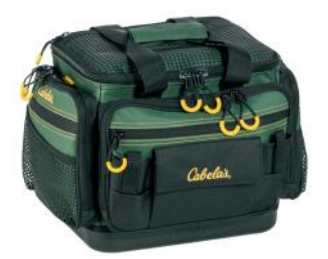
Soft side tackle box